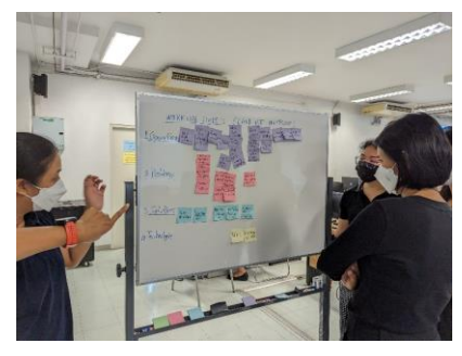
Lectures, lab sessions, and ideathon workshops