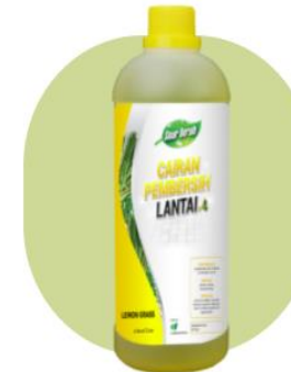
CLEANING PRODUCT Pembersih Lantai Lemongrass