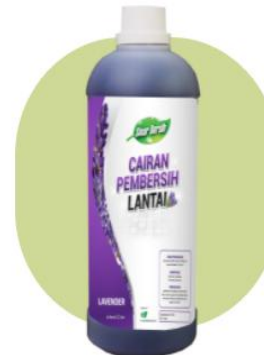
CLEANING PRODUCT Pembersih Lantai Lavender