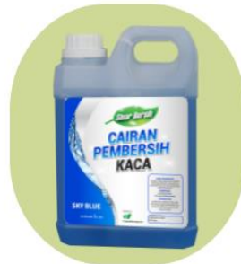
CLEANING PRODUCT Pembersih Kaca