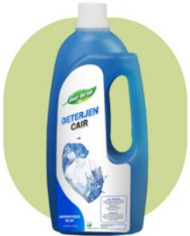
CLEANING PRODUCT Deterjen Cair