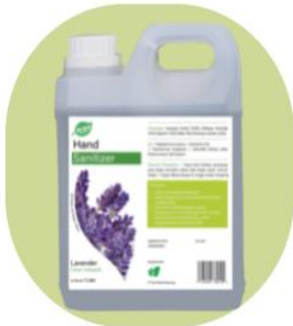
CLEANING PRODUCT Hand Sanitizer 1 Liter