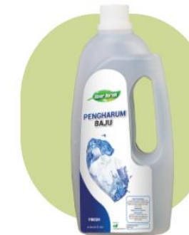
CLEANING PRODUCT Pengharum Baju