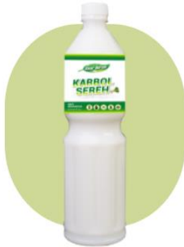
CLEANING PRODUCT Karbol Sereh