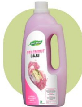
CLEANING PRODUCT Pelembut Baju